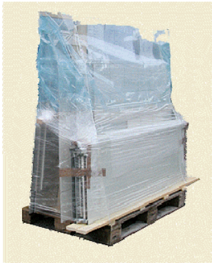
Tiled walls wrapped for all climates