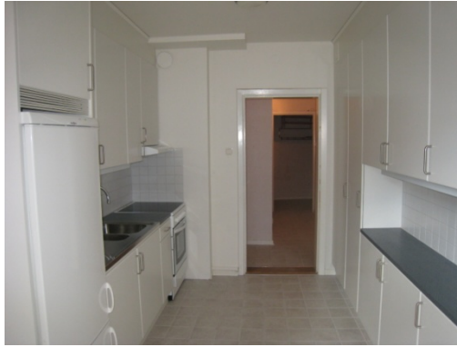
Picture of a new kitchen