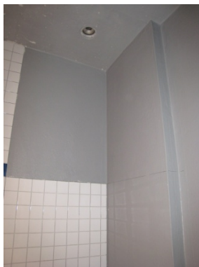
Picture of a bathroom with moisture protection