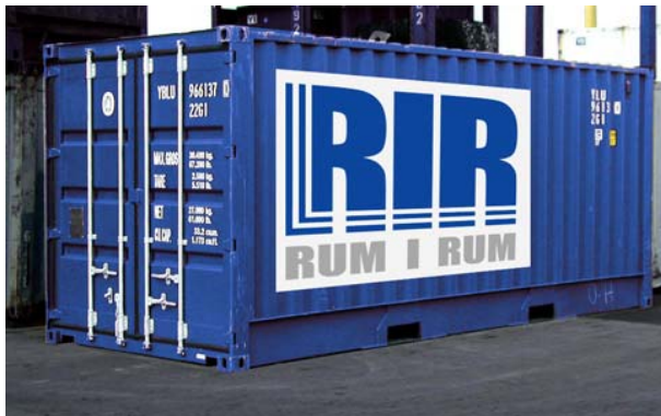
Material shipped by container to the construction site