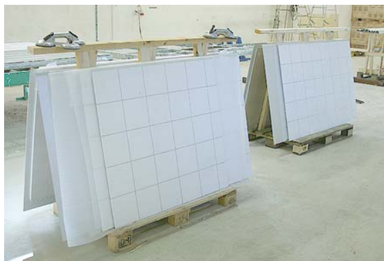
Finished walls packaged in factory