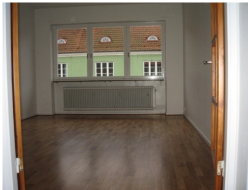
Renovated living room in Kirseberg. New parquet floor gives 55 kr/month.