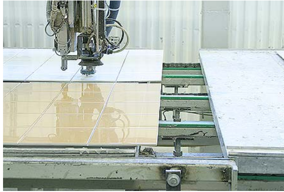
A Robot puts tiles on the new walls