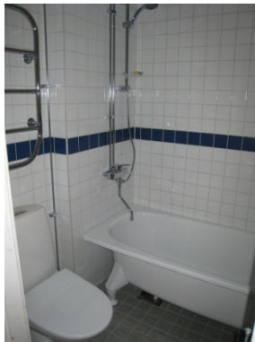
Picture of a new bathroom