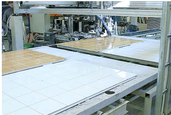
Top and bottom of the new walls are followed after each other in the production line

Frequent questions about prefabricated bathrooms: