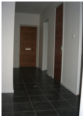
Renovated hall in Kirseberg.

A new kitchen gives 450 kr/month, Stove with Ceramic rings gives 50 kr/month, new lighting gives 25 kr/month, new tiles gives 45 kr/month.