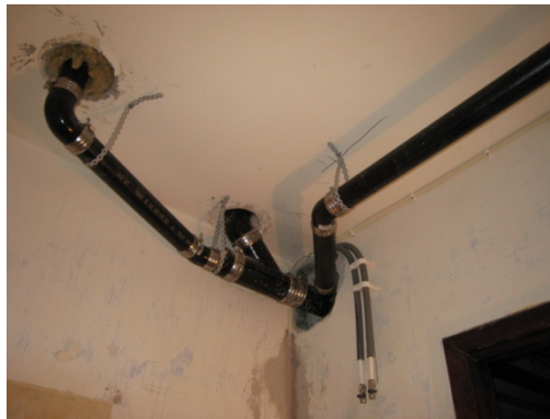
A picture of new sewage pipes

Södra Förstadsgatan 119 – Week 8 to Week 18