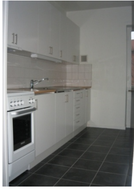
Renovated kitchens in Kirseberg.

A new kitchen gives 450 kr/month, Stove with Ceramic rings gives 50 kr/month, new lighting gives 25 kr/month, new tiles gives 45 kr/month.