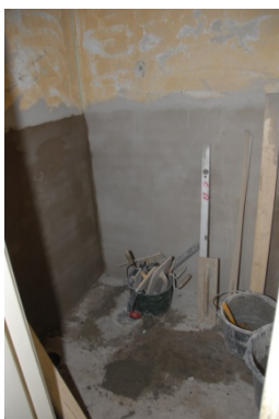
Picture of a bathroom where repair work is started

After that the builder considers themselves finished with the apartment, and cleaning has been completed; it is time for inspection together with the builder, our project manager and external consultants. Remarks should be corrected within a reasonable time, about one to two weeks.